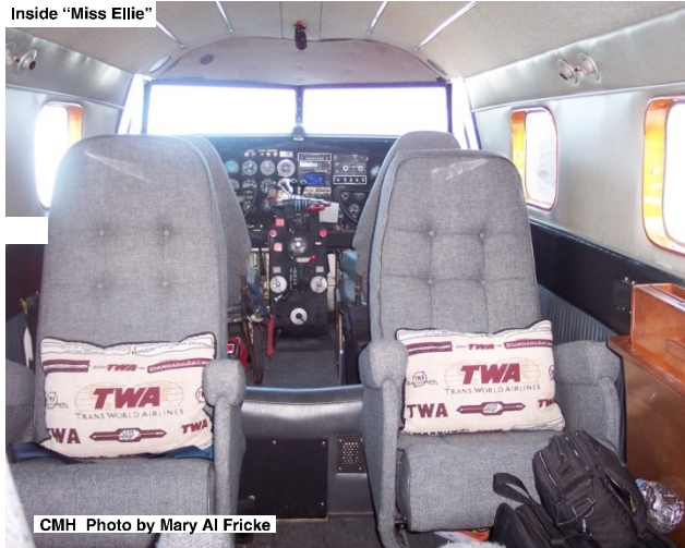
Inside "Miss Ellie"