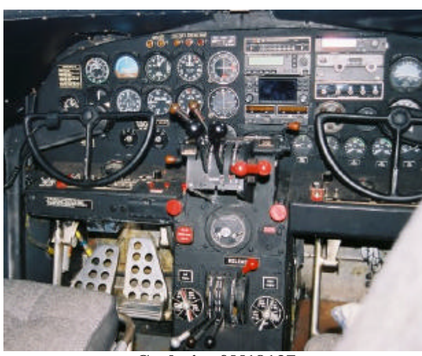
Cockpit of N18137

Her goal is to get checked out in it which will of course require a twin engine rating, taildragger endorsement, and quite a few hours getting comfortable with Dad's old mount.