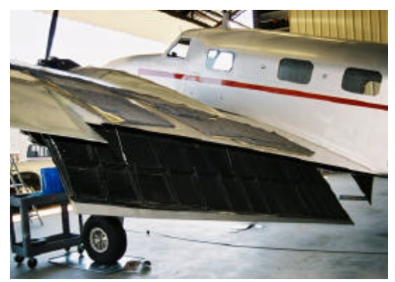
Large Electric Flaps

and the ailerons droop when the flaps are deployed. The tail wheel is locked for take off and landing to assist with directional stability before the rudder becomes authoritative.