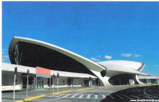
TWA Terminal 5 at Idlewild /JFK, Eero Saarinen, 1962 and the restored and expanded JetBlue facility (below).

My 1st family and memories are TWA and flying, thinking that everyone lived that way. Though never a doubt that magical old #240 would arrive at JFK, there was a momentary (thought of), "What am I doing over the Rockies in a 70 yr. old airplane?" That moment passed to the awesomeness of the mystery of NC18137 finding me after 68 years and the surprise of JetBlue's T-5 honoring TWA with the Lockheed, a symbolic 'Spirit of TWA'.