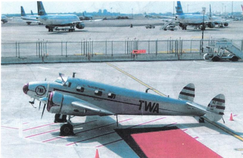
First aircraft to arrive at the new JFK Terminal 5

Wow, thoughts on 'Coast to Coast 2008'. Mystery and memories. Words can't express and/or condense the thoughts; the mystery of this adult-child living this improbable dream and literally reliving childhood memories; 70 years condensed into 9 days. Just as I can't describe "The Spirit of TWA" i.e., the TWA L.E.12A, the TWA people, my TWA family that was and still feels like my family.