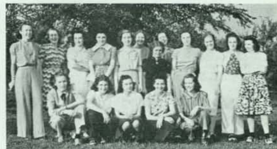
Pittsburgh TWAers are willing to match pulchritude of their employees and wives with any station on the system. Here's a typical group, shown during a recent picnic. Any station that can top this group for looks is requested to send in a photo.