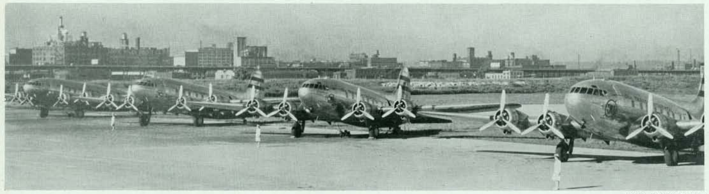
The nation's newest and biggest air transports—TWA's four-engine, 33-passenger "Stratoliners"—are now in service. On July 8, first regular transcontinental schedules were inaugurated over TWA's route and air travelers now can enjoy trips in the first modern four-engine planes operated in domestic service. Transport equipment worth more than $1,500,000 is represented in this picture.