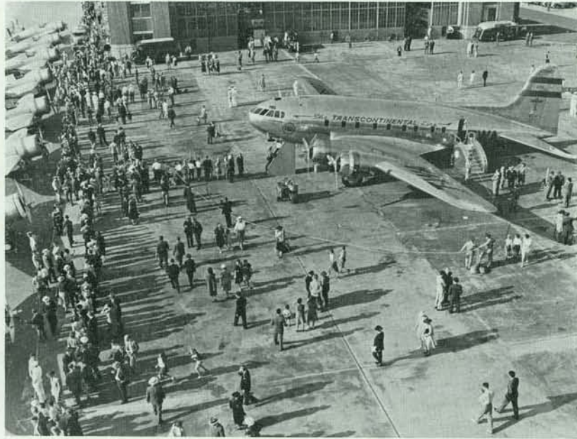
Here's a portion of the crowd that inspected the interior of the TWA "Stratoliner" that was on inspection in Washington following its christening. The thousands filed in line through the plane from the crew entrance in the nose and out the passenger door. See story, this page, column 1.