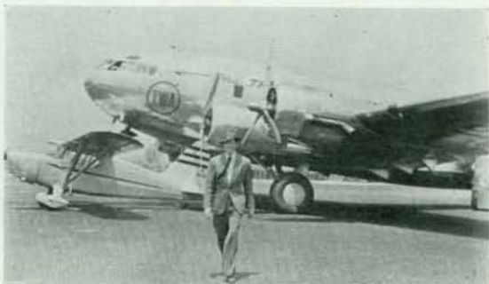
Jimmy Stewart, MGM star, decided to learn at first hand the size of TWA's new "Stratoliners," so he rolled his own private plane, a Stinson "105," up to the Boeing at Burbank. The picture tells its own story.